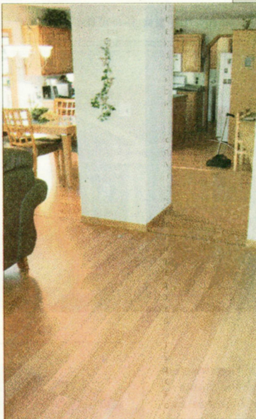
Thelen Construction installed the hardwood floors for this home's renovation.

Call Thelen Construction for a free estimate at (406) 253-1109.