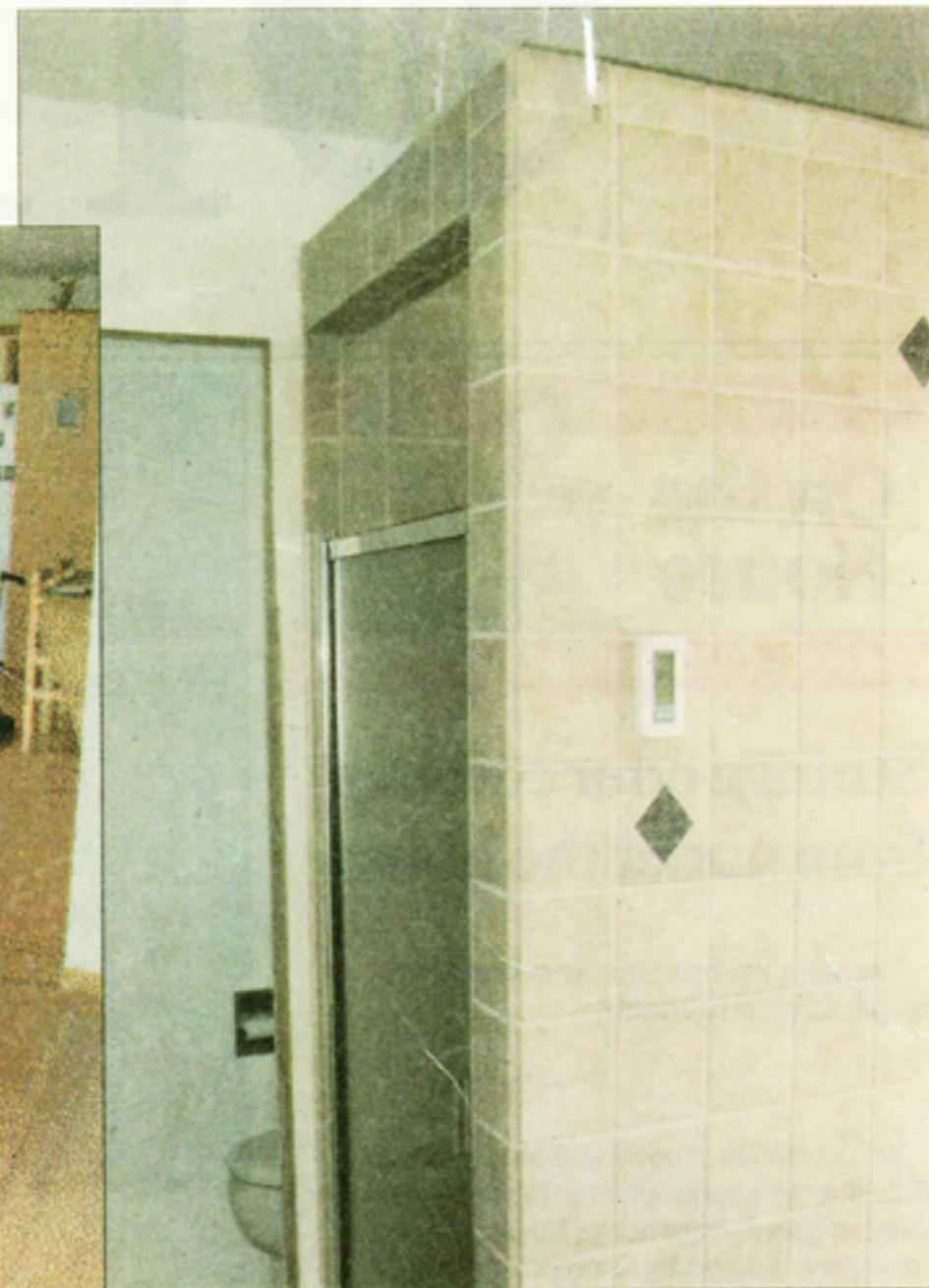
Thelen Construction also does custom bathrooms and construction.